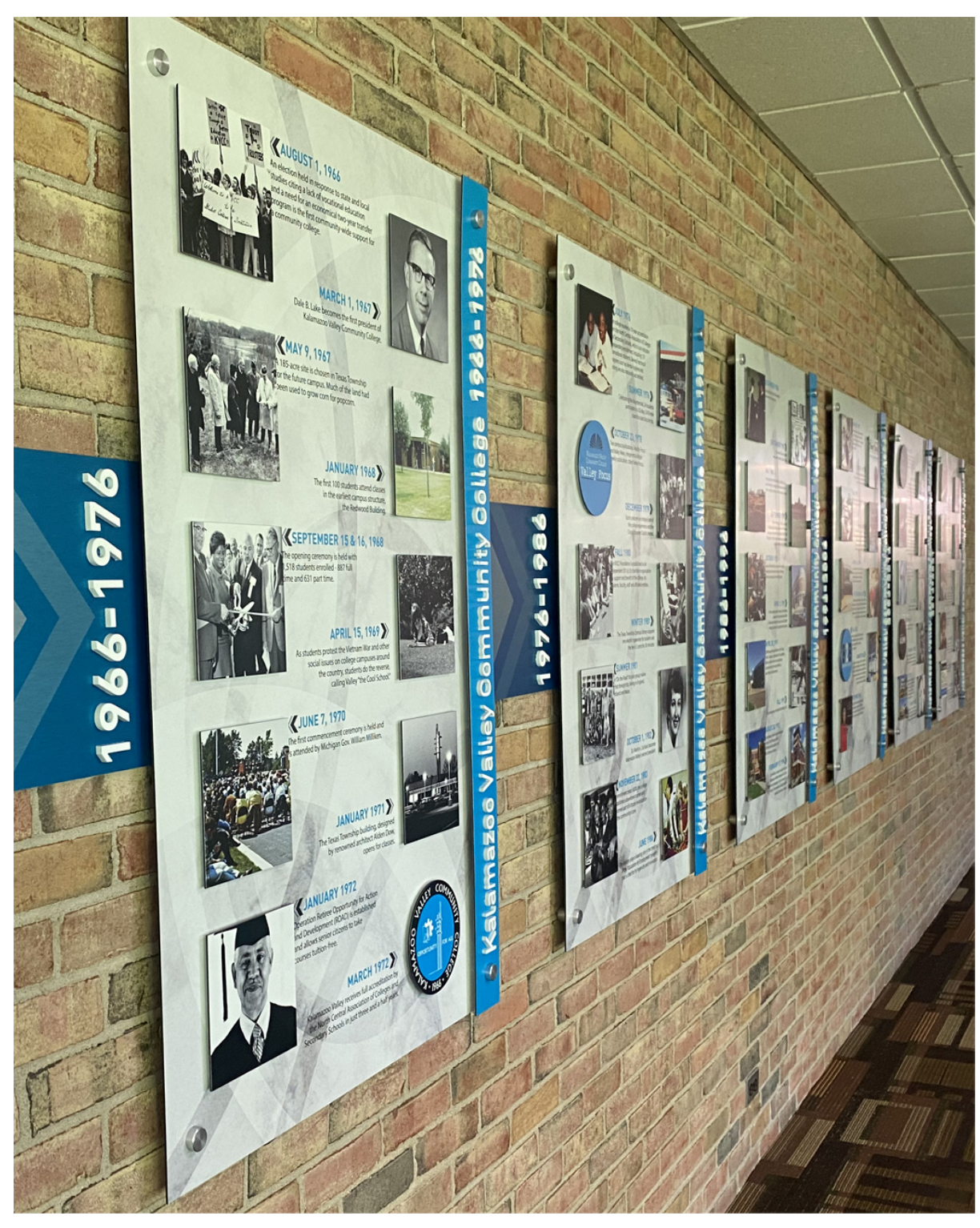
Artwork detailing the college's rich history has been installed in the hallway outside of the President's office. Come by and walk down memory lane.